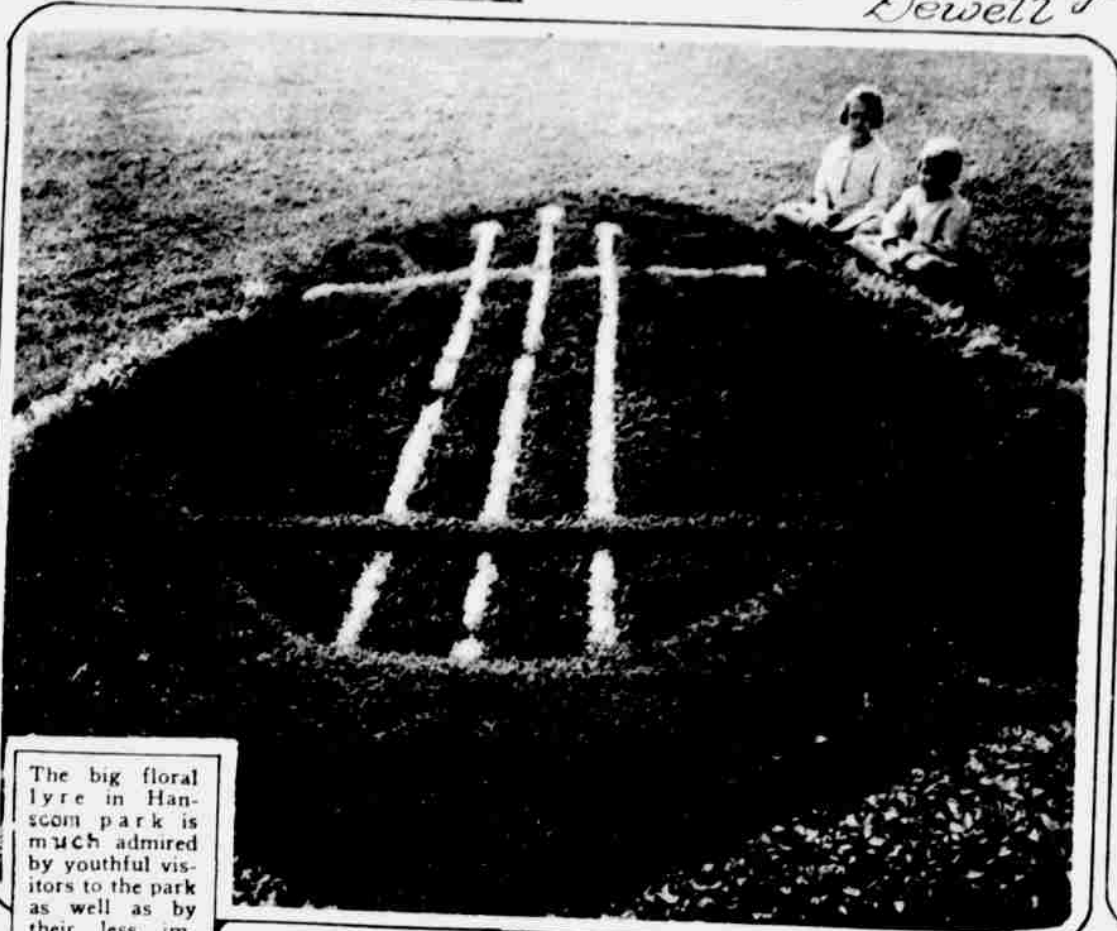
The big floral lyre in Hanscom park is much admired by youthful visitors to the park as well as by their less impressionable elders.