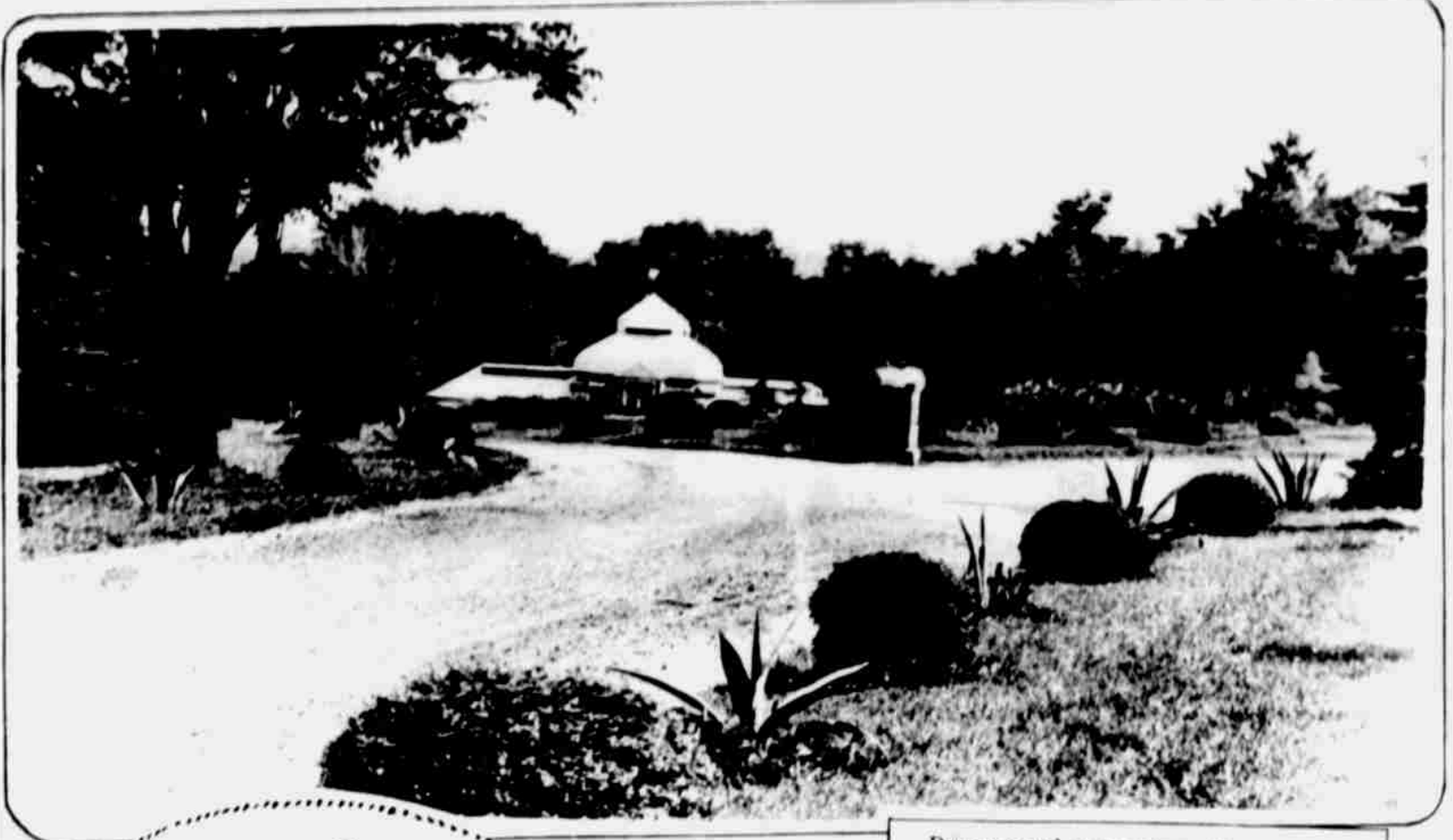
Driveway and conservatory, Hanscom park.