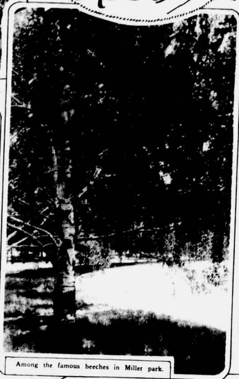
Among the famous beeches in Miller park.