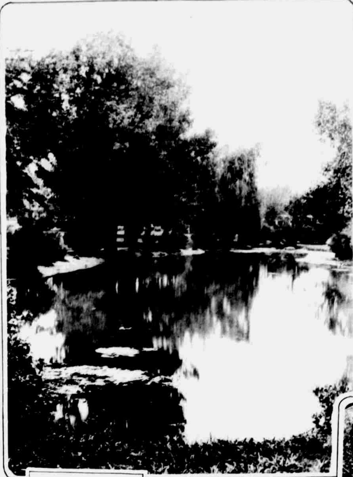
The lagoon in Kountze park.