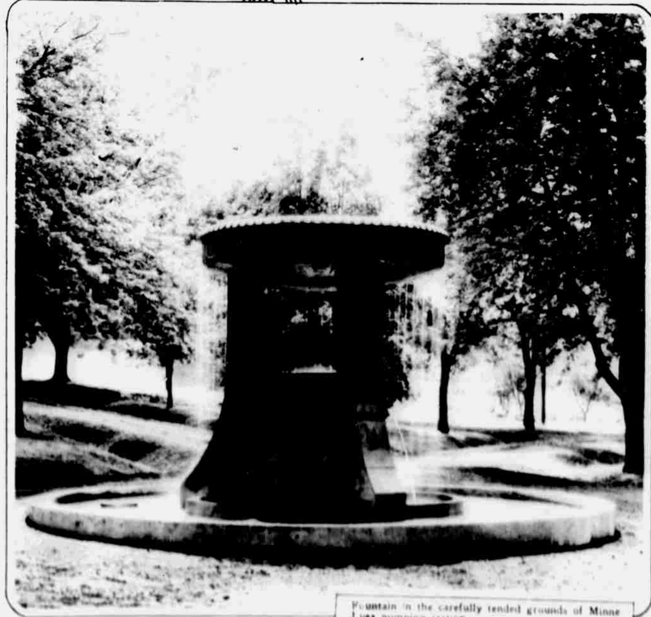
Fountain in the carefully tended grounds of Minne Lusa pumping station.