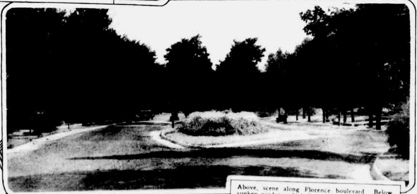
Above, scene along Florence boulevard. Below, sunken gardens which form one of the beautifying features of Happy Hollow boulevard.