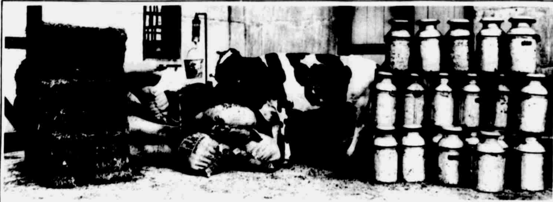
A MODERN MILK FACTORY. Maryland's champion dairy cow, a prize Holstein of the U. S. Department of Agriculture's herd at Beltsville. She produced more than 25,000 pints of milk last year. On the left is the amount of food bossy consumes in a month—548 lbs. of hay, 649 lbs. of grain, 250 lbs. of dried beets and 661 lbs. of corn silage. At the right are the twenty-one cans required to hold the 2,677 lbs. of milk she gives every month.