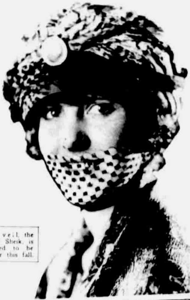
This veil, the Crown Sheik, is expected to be popular this fall.