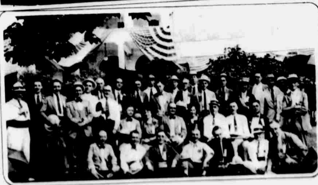
Right, Nebraska-Iowa delegation photographed at the 1922 Lions' international convention at Hot Springs, Ark.