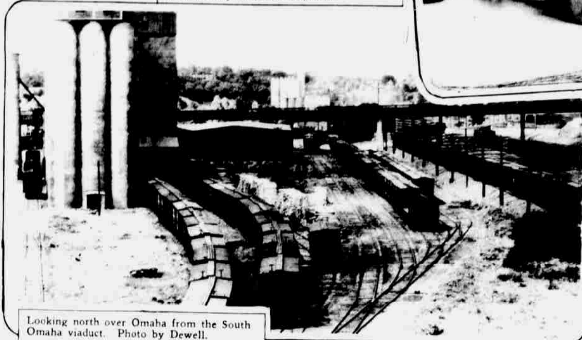
Looking north over Omaha from the South Omaha viaduct.