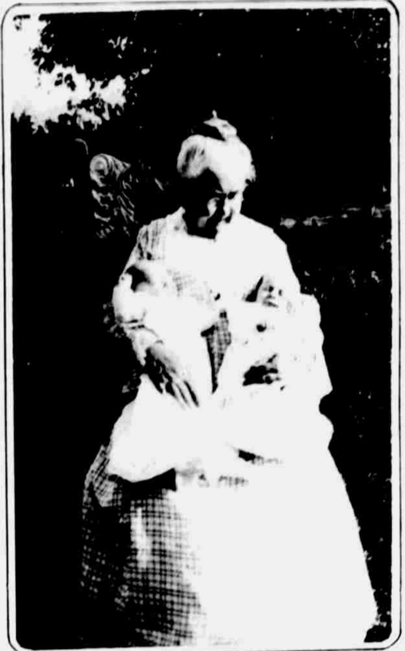
Grandma and the twins.