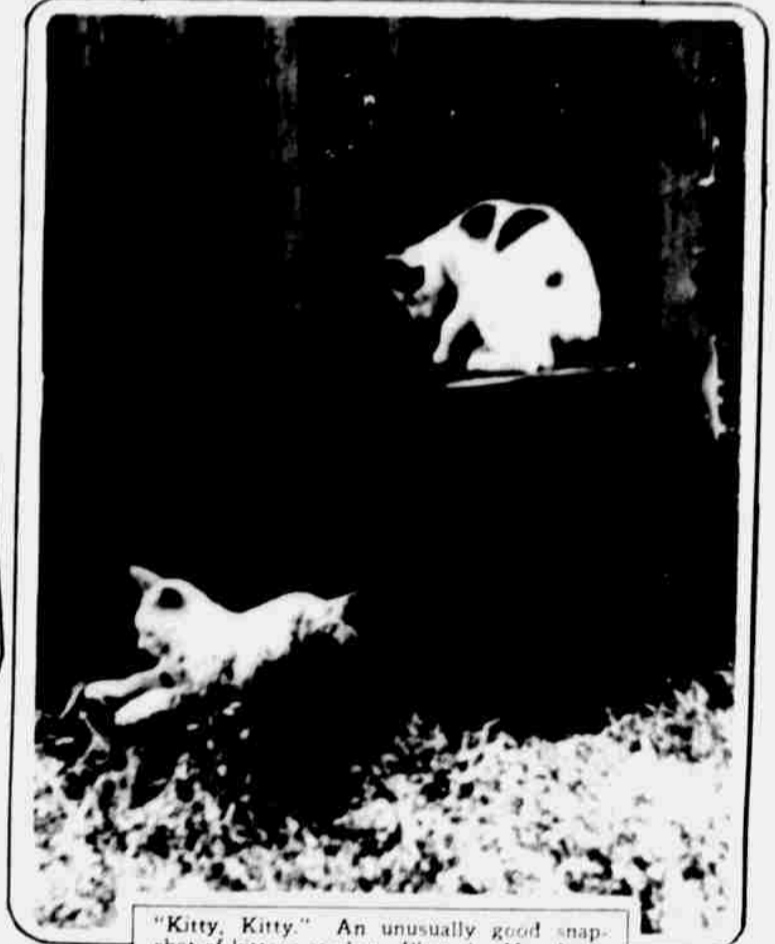
"Kitty, Kitty." An unusually good snapshot of kittens at play.