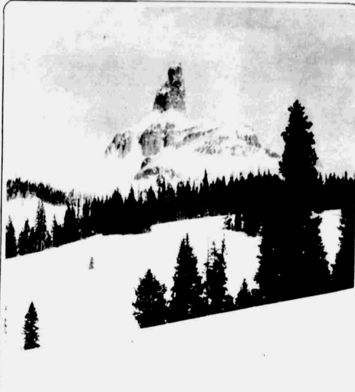
Lizard Head, altitude 13,156 feet is one of the unscaled peaks of the Rockies. The peculiarly shaped shaft, located in the San Miguel mountains of southwestern Colorado, has thus far defied all attempts of mountain climbers.