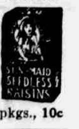
3 pkgs., 10c