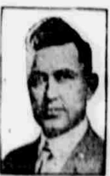
Geo. B. Brown

Colanders. 6-qt. Sauce Pans. Oblong Bake Pans. 2-qt. Coffee Pots. 8 and 10-qt. Pails. Nest of three Sauce Pans. 4-qt. Covered Berlin Kettle. Nest of three Mixing Bowls. 14 and 17-qt. Round Dish Pans.