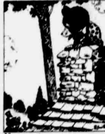
"You've eaten it on your way up the chimney!" Mr. Bear roared.