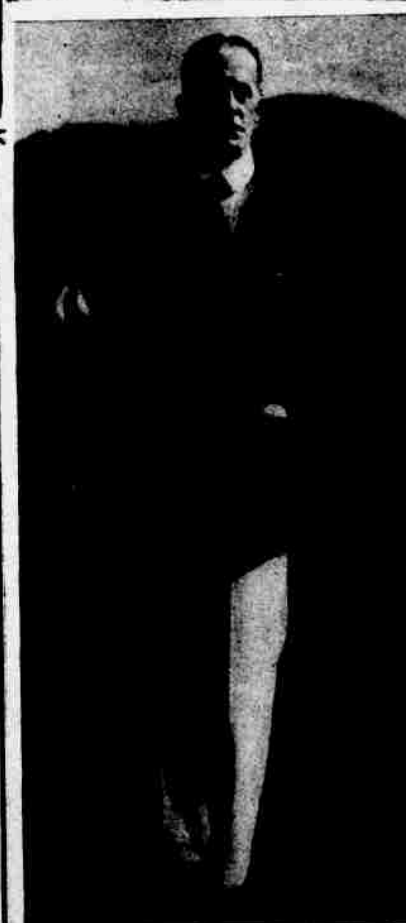
Admiral Sir William Pakenham, Commander-in-Chief of British forces in North American waters, on the Kebo Valley Club links during a visit at Bar Harbor, Me.