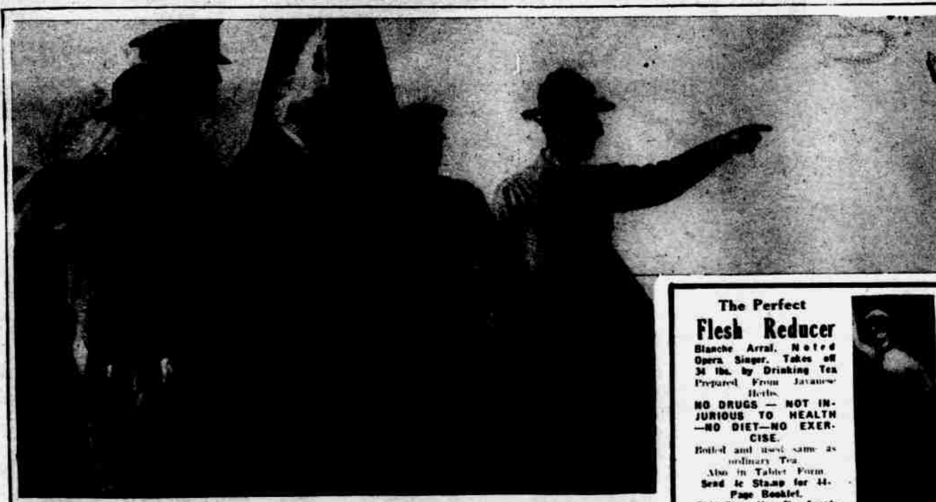
President Harding with Gen. Pershing, Major-Gen. Lejeune and Major-Gen. Butler standing by the Presidential flag and watching the U. S. Marines during the mimic battle of Gettysburg recently.

The Byrd Nurseries Dodge Road, West of Fairview Phone: WA 3876, KE 3439