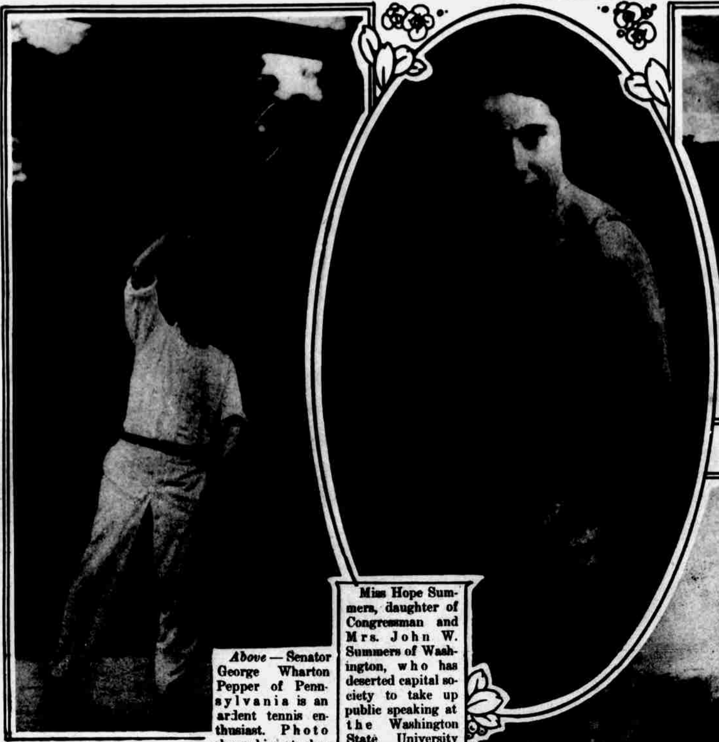
Above—Senator George Wharton Pepper of Pennsylvania is an ardent tennis enthusiast. Photo shows him at play on the White House courts.