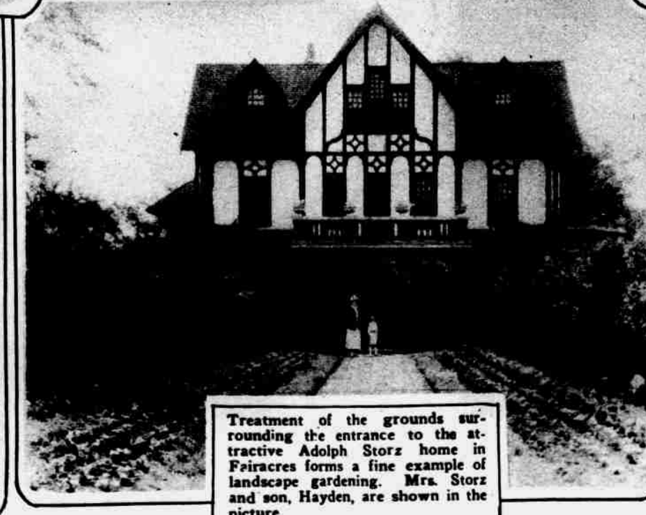
Treatment of the grounds surrounding the entrance to the attractive Adolph Storz home in Fairacres forms a fine example of landscape gardening. Mrs. Storz and son, Hayden, are shown in the picture.