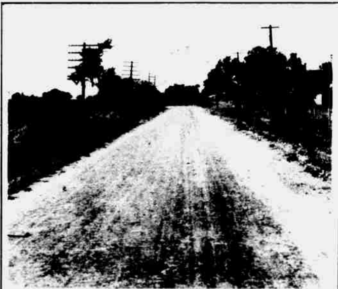
Washington highway, going north of Florence to the county line, paved with vitrified brick in 1921.