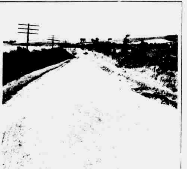
Part of Lincoln highway leading into Elkhorn paved with vitrified brick, built in 1920.