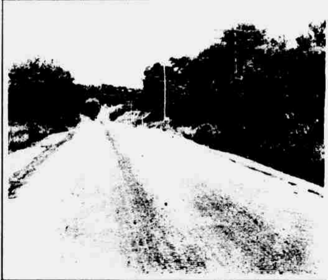
This stretch of brick paving, familiar to autoists on the present Lincoln highway, between Omaha and Elkhorn, was laid in 1898, 24 years ago, and is still functioning without repairs. Considered one of the eight wonders in the paving world, as it was laid on sand base only.