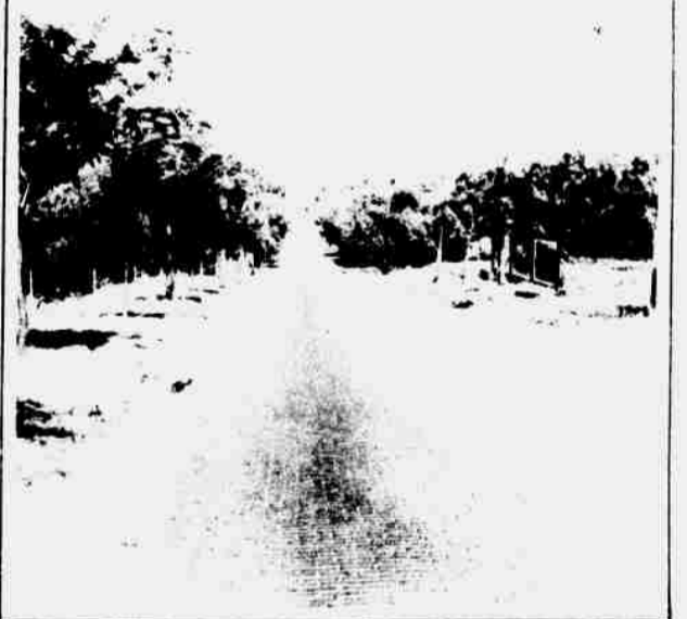
Dodge street, Dundee, past Happy Hollow, part of the Lincoln highway, paved with Murphysboro vitrified brick 10 years ago and has never required repairs.