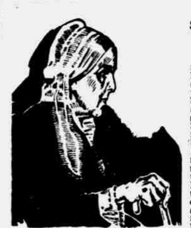
How glorious you will feel, mother, when your rheumatism is all gone. Let S. S. S. do it. It will build you up, too!

To prove their faith in the proposed "King of the Air," the engineers cabled a challenge for an international race around the world in