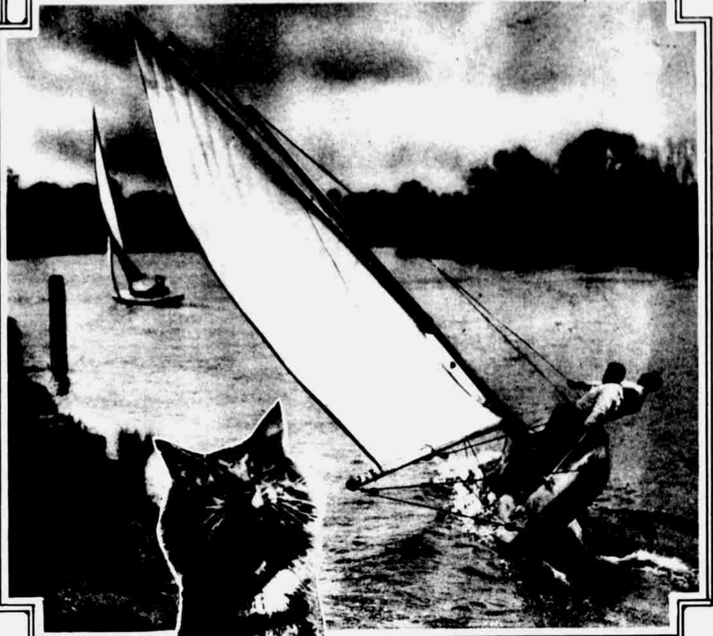
A scene on the Thames during a club race—taking a sharp turn just above Teddington Lock.