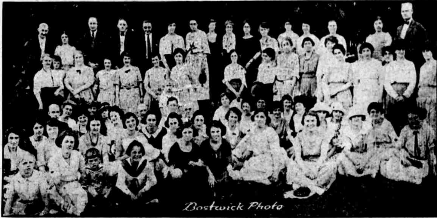
Thompson-Belden employees at an outing at Elmwood park. They went out to have a good time and they had it.

for this year and next year contemplate a number of very large contracts. They feel they are contributing in a measure to the prosperity of Omaha.