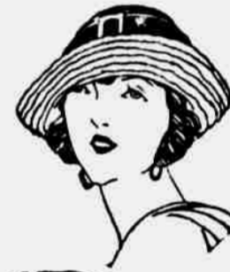
No C. O. D's.