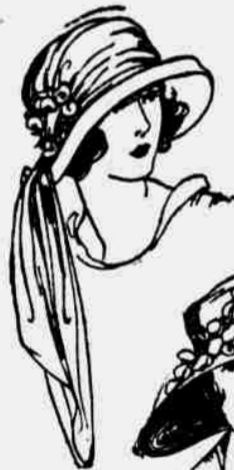
No Will Calls.

Offering You the Unrestricted Choice of Any Hat in Stock