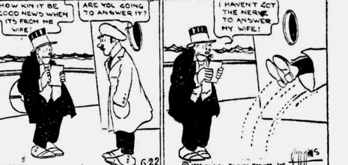
Drawn for The Bee by McManus (Copyright, 1932)