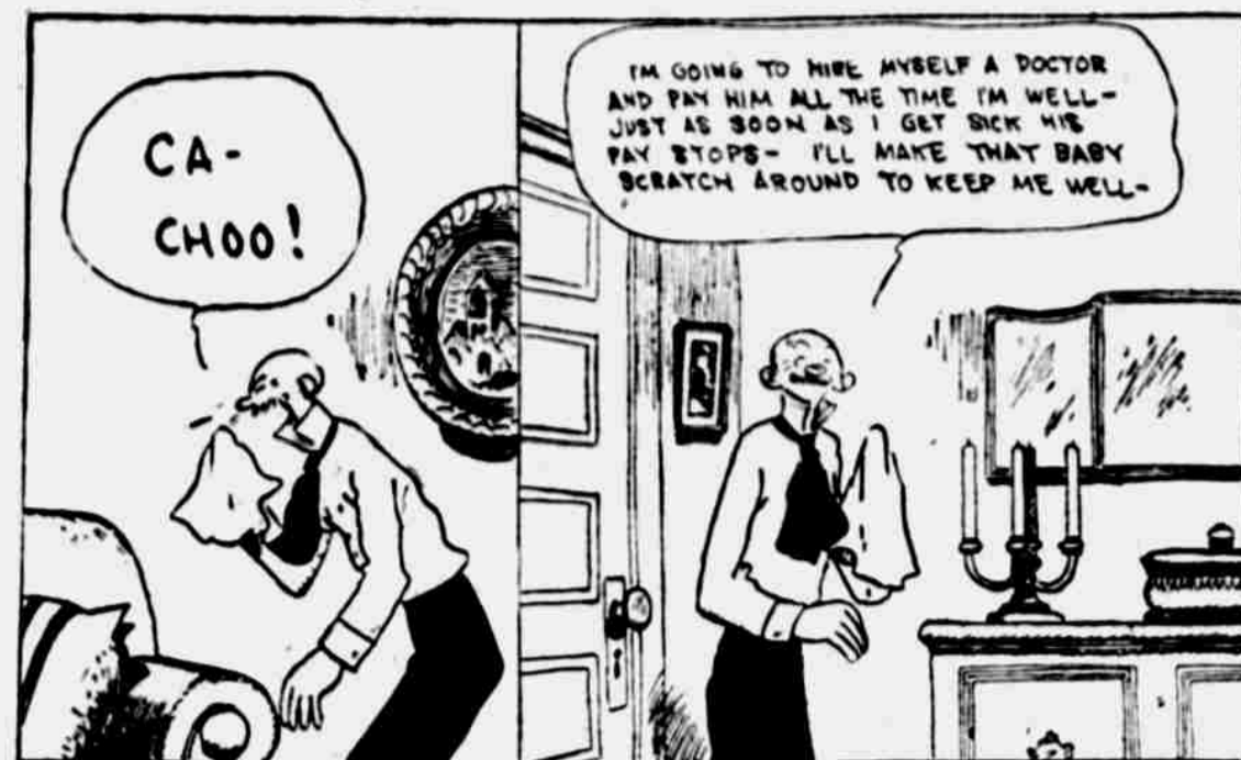
BRINGING UP FATHER--- C. S. Patent Office