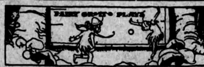
By EMILIE BLACKMORE STAPP and ELEANOR CAMERON.

He ran with all his might and main, Until he reached the road again. Complete the picture by drawing a line through the dots, beginning at Figure 1 and talking down numerically.