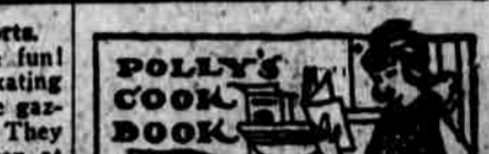
POLLY'S COOK BOOK

As soon as the Teenie Weenie children are old enough they are taken out into the woods, where they are taught many useful things. They are told what berries make good food and where to find them.