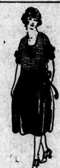
Ki Ki Dress, sateen and percale, a distinctive model 2.95