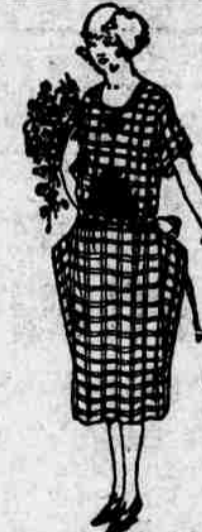
Imported Gingham, hand embroidered, at 4.95