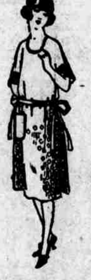
Chambray and Percale, in contrasting colors 3.95