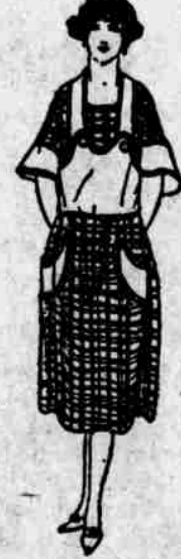
Amoskeag Gingham and Chambray, plain and checked 2.95