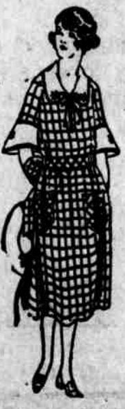
Amoskeag Gingham with organdy hand embroidered 2.95