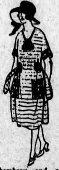
Chambray and cretonne trimming 1.95

Sunbeams Will Light the Way for Hurried Shopping Trips