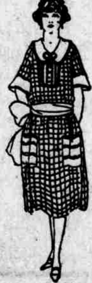
Tissue Gingham, organdy collars, cuffs, and pockets 4.95