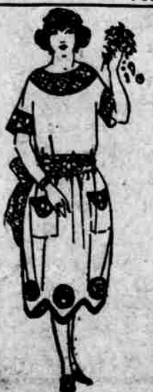
Jay Crepe with Cretonne trimming with scalloped hem 2.95