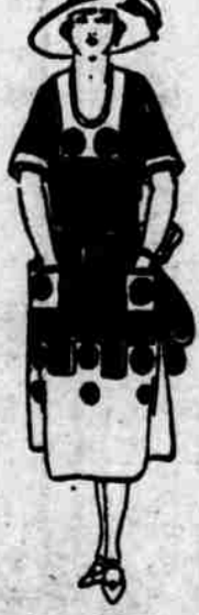
Chambray in two-tone novelty style 1.95