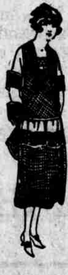
Checked Gingham with organdy and lace 2.95