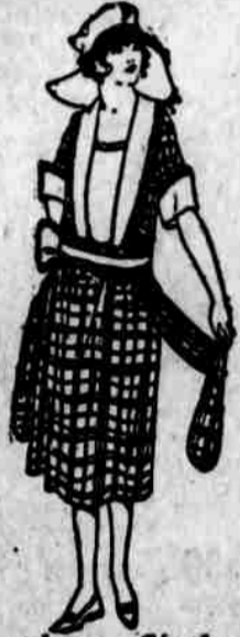
Amoskeag Gingham with organdy trimming 3.95

SUNBEAM DAINTY DAY DRESSES have been especially designed by the originators to meet the demands of the modern woman who desires style and quality at the lowest possible price. They may be worn in the home, on the street or for afternoon. No matter where you are or what you are doing, if you have on a Sunbeam Dainty Dress you will look dainty all day the Sunbeam way. They are so beautiful and so practical that they may be used all along the line of woman's daily activities. You will be interested in knowing that every experienced department store man or woman who has examined these garments has displayed marked enthusiasm and wonder that so excellent a garment can be sold at such remarkably low prices.