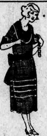
Imported Gingham with picque binding at 4.95

Come Early Thursday Prepared to Buy Your Whole Season's Supply