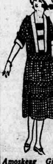
Amoskeag Gingham and Chambray with organdy trimming 2.95