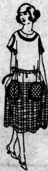
Cross Bar Muslin and English Print, daintily decorated 3.95