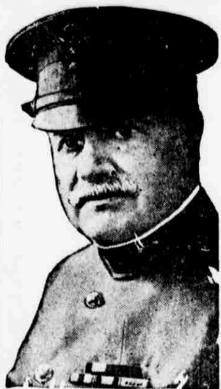
LIEUT. GEN. HUNTER LIGGETT

Not all of the work of preparing for the convention is being handled by Legionnaires. San Francisco has made a systematic study of conventions and the result has been the development of an efficient corps of prominent business men, who, originally "hobbying it" as convention workers, got into the hang of the activity so well that they find themselves called into conference