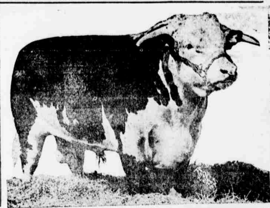
The greatest live stock show of the middle west will be staged at the coming Nebraska State Fair, Sept. 2 to 7th inclusive. Barns will be full of just such wonderful specimens as is pictured above. We know you do not want to miss this opportunity of seeing Nebraska on display so all arrangements are being completed for your visit to Lincoln the first week in September.

We sold a lady in Burr Oak, Kansas, a rug. She saved enough on this rug to buy a nice rocker. She is going to send her friends in to buy their rugs. Johnson & Graham Furniture Co., Red Cloud, Nebr.