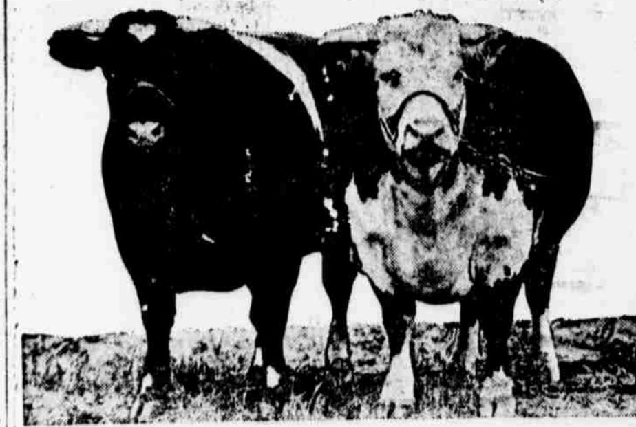
A Shorthorn and a Hereford—two year old heifers—typical of the strictly beef type. It is not so material just what breed of animals you are raising—but it is material that they should be pure bred and come from real producing ancestors. This way it is possible to turn a loss into a profit. An annual visit to the State Fair at Lincoln, September 2 to 7th inclusive will be a real education to you, especially if you are desirous of keeping abreast of the progress that our agricultural and live stock industry is making.

The County Fair will be held at Bladen Next Week