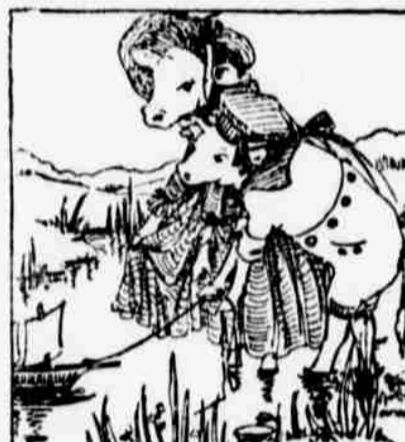
"They're Well Pleas'd."

"It is true that we wouldn't find silk waists very useful. I can't imagine myself being able to button or hook one up. I'd find it very awkward I feel sure. And I don't think bonnets would be becoming to us. Shawls would get in the way. I fear I'd find