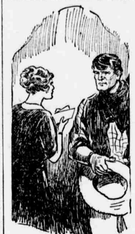
And Now, Conscious of Her Sudden Color, a Genuine Blush Flamed on Her Face.

As he looked up to see her standing there, dressed to receive her eastern guests, he checked his advance with a violent action which recalled to Madeline the one he had made on the night she had met him, when she disclosed her identity. A man struck by a bullet might have had an instant jerk of muscular control such as convulsed Stewart. In that instant, as her keen gaze searched his dust-caked face, she met the full, free look of his eyes. Her own did not fall, though she felt a warmth steal to her cheeks. Madeline very seldom blushed. And now, conscious of her sudden color, a genuine blush flamed on her face. It was irri-