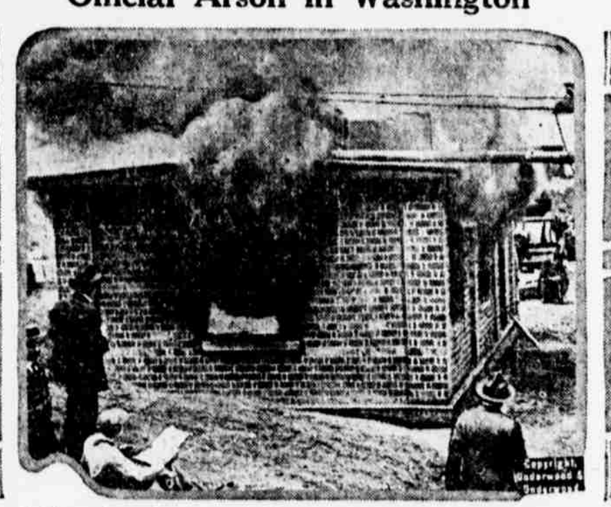
Deliberately setting a new building on fire seems a strange thing to do, but that's exactly what happened at the bureau of standards in Washington, the idea coming from Secretary Hoover. The object of this official fire was to test out the inflammability of various materials used in making office equipment and in construction of buildings.