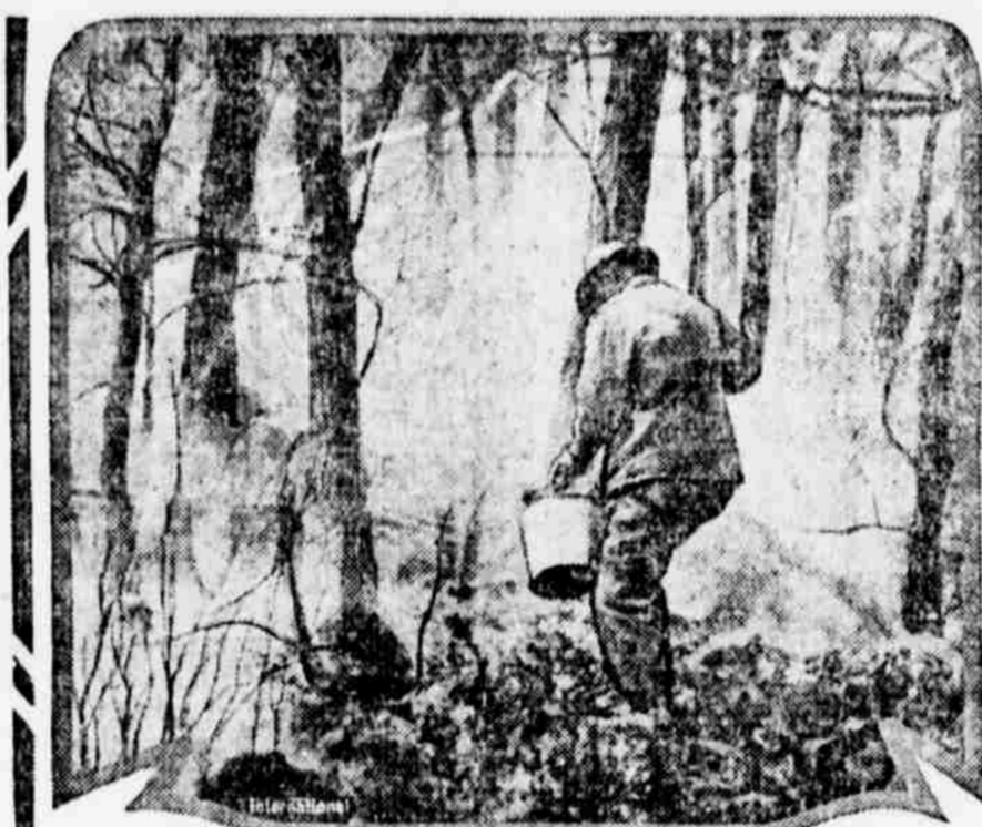
Scores of towns in eastern Pennsylvania have been endangered by forest fires raging in the Pocono mountains, about 25 miles north of the Delaware water gap. Great timber belts have been destroyed in the neighborhood of Bushkill falls and Resaca. Hundreds of men and boys were mobilized by the state forestry department to fight the blazes.