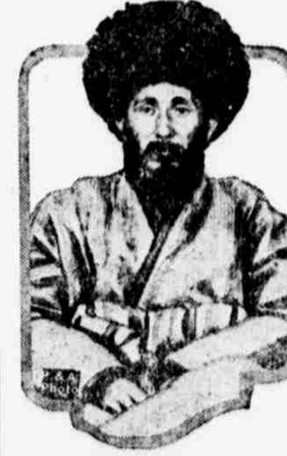
This is the khan of Khiva, ruler of the territory south of the Aral sea, who was taken prisoner by the Bolsheviks and confined in the Butyrk prison at Moscow. The khan has been succeeded by an ex-American tailor who, it is said, has also taken as legacy his harem of three hundred wives.