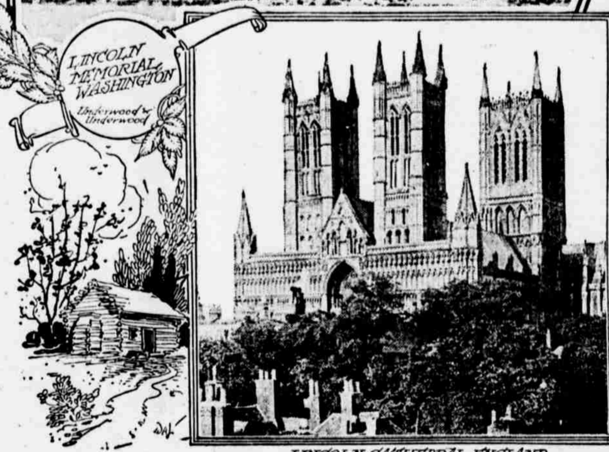
Lincoln Cathedral, England

"Here was the great purpose, here the towering hope, here the supreme faith. He treasured the inheritance handed down by the founding fathers,