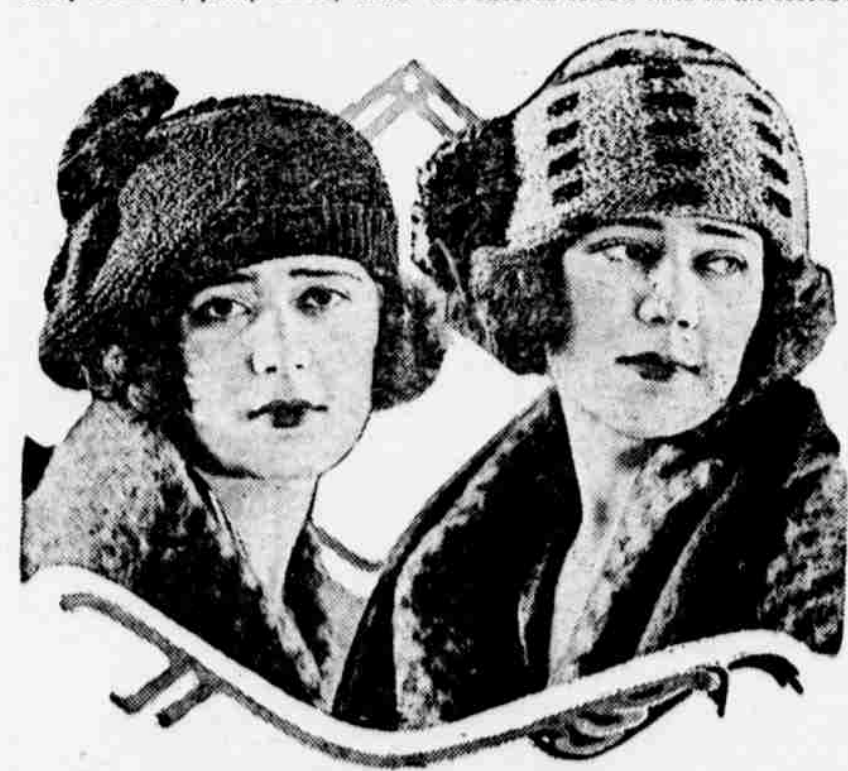
Headwear That Suits Schoolgirl.

covered buttons, parallel rows of nar- The "hat to match" idea promises row fancy ribbons, pump bows, bead the success of felt hats in all colors for