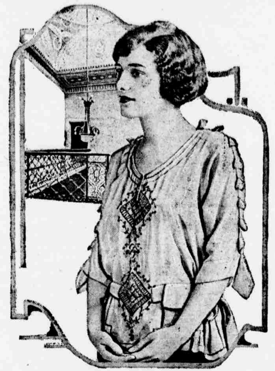
One of Coming Season's Blouses.

MODERN women, like the Athenians, are always looking for ties, of which the pole tam, in tan something new, and blouse makers are shades, appears with quill or flower determined that this fall they shall trim of black velvet. The polo tam is find what they are looking for. Troops | made to match the polo coat, and alof lovely new costume blouses are most any coat can find its matching passing in review, almost no two of hat, either in a tam or a soft, round them alike, endlessly varied in design, bat, with a brim that can be turned many of them made of novel materials up or down. These hats are made of that the season has brought in. These | coat fabrics, as tweed or velours, but new materials immediately gained a there are some felts among them. foothold and are industriously climb- Some of the tams are made to fit snuging. They include satin-faced pebble by the insertion of an elastic band crepes, crepe metalasse, varied rasha- across the back, which holds them nares, chiffon velvets and various bils- firmly to the head.