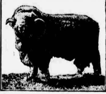
Prince of Parowan, Rambouillet Ram on Government Farm in Idaho.

Ranchers from Washington, Oregon, California, Arizona, Nevada, Utah, Idaho, and Montana, about 200 persons in all, recently attended a field day at the government sheep farm in eastern Idaho, where they studied the results of the breeding work done by the department, particularly that with Rambouillets. The famous Rambouillet ram, Prince of Parowan, attracted much attention from these