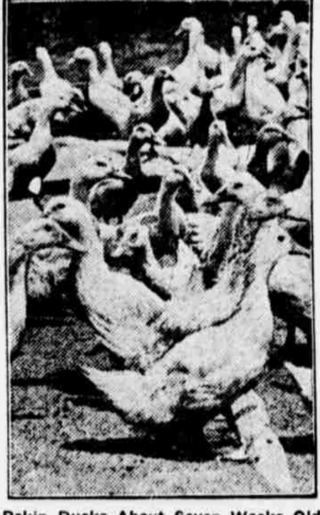
Pekin Ducks About Seven Weeks Old in Fattening Pen.

"For the general farmer who is more interested in obtaining eggs than producing meat, the Runner is a good breed. This duck holds the same relative position in the duck family that