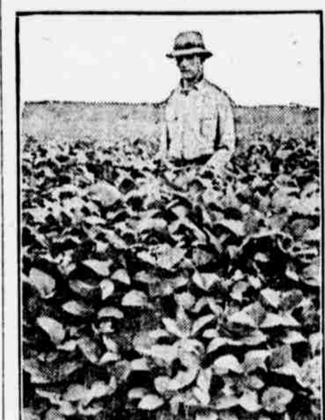
An Indiana Field of Sov Beans,

Although definite figures are not available on the acreage of soy beans in the various states, reports to the United States Department of Agriculture indicate very large increases in acreage for seed production and forage purposes throughout the northern and corn belt states. The possibilities of utilizing domestic grown beans for oil and meal no doubt had much to do