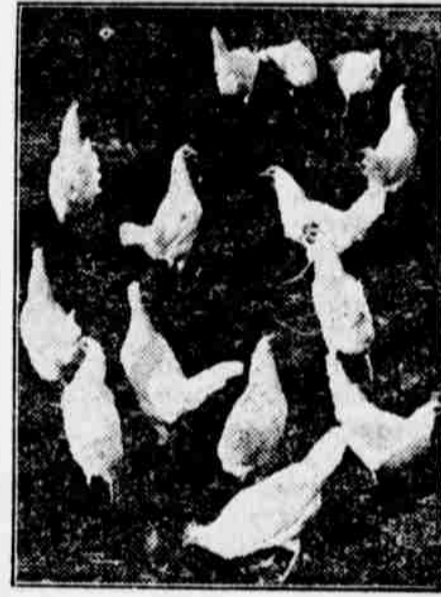
In Addition to Free Range Pullets Should Be Given Plenty of Mash.

The most common mistake is poor feeding. The pullets are allowed free range over the farm and compelled