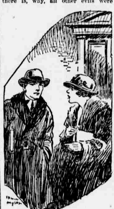
He Swallowed. "Yes."

"She said it might be true, but since nothing at all could be a right cause for war, then all this couldn't be a cause for war. Of course she had her regular pacifist 'logic' working; she said that since war is the worst thing there is, why, all other evils were