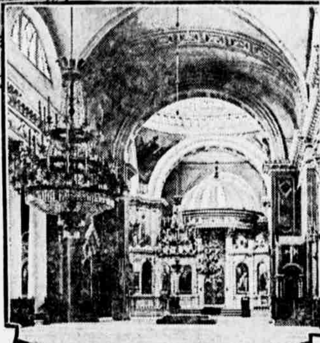
CATHEDRAL OF ODESSA