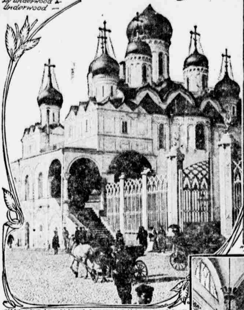
CATHEDRAL OF THE ANNUNCIATION, MOSCOW