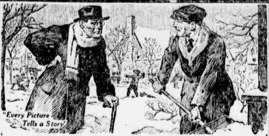
Every Picture Tells a Story