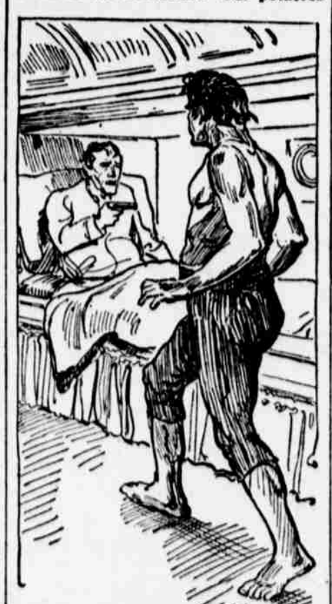
"Out of My Cabin or I'll Riddle You," He Barked Feebly.

"Two hundred and eighty-seven days from Hamburg, Mr. Gibney. Our vegetables gave out and we drank too much rain water and ate too much fresh fish down in the Doldrums. Our potatoes