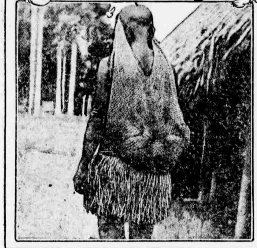
New Guinea Woman and Baby.

(Prepared by the National Geographic Society, Washington, D. C.)