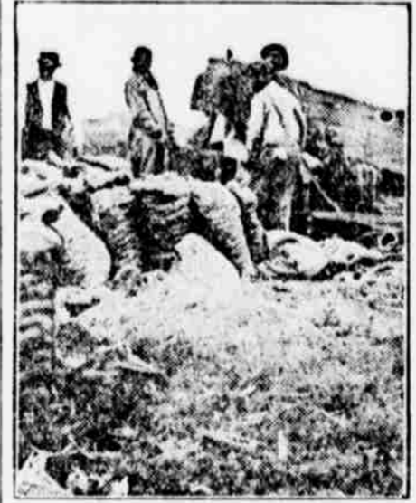
Grading Potatoes in Southern Field.

Owing to varying climatic conditions, due to both latitude and altitude, there are three distinct potato-crop seasons in the Southern states. These are the early or truck crop, the late or main crop, and the fall crop.