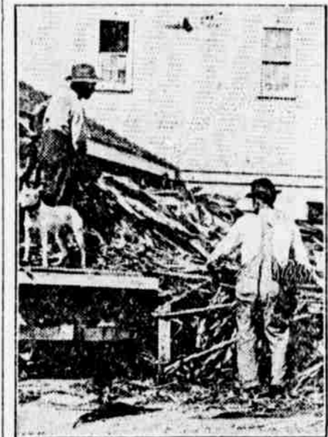
A Low-Down Flat Wagon Saves Labor in Handling Corn When Filling Silo.

If the silage cutter and lifting machinery have not been selected, every effort should be made to get machinery which has sufficient or excess capacity.