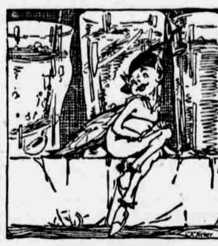
"Not Really Strange."

wasn't strange?" asked the Lemonade. "Did I understand you to say that?" asked the Ice Tea. "Of course I don't suppose it is so strange as far as my family is concerned, as all my hot tea relatives are around all the time, all the year, and every year."