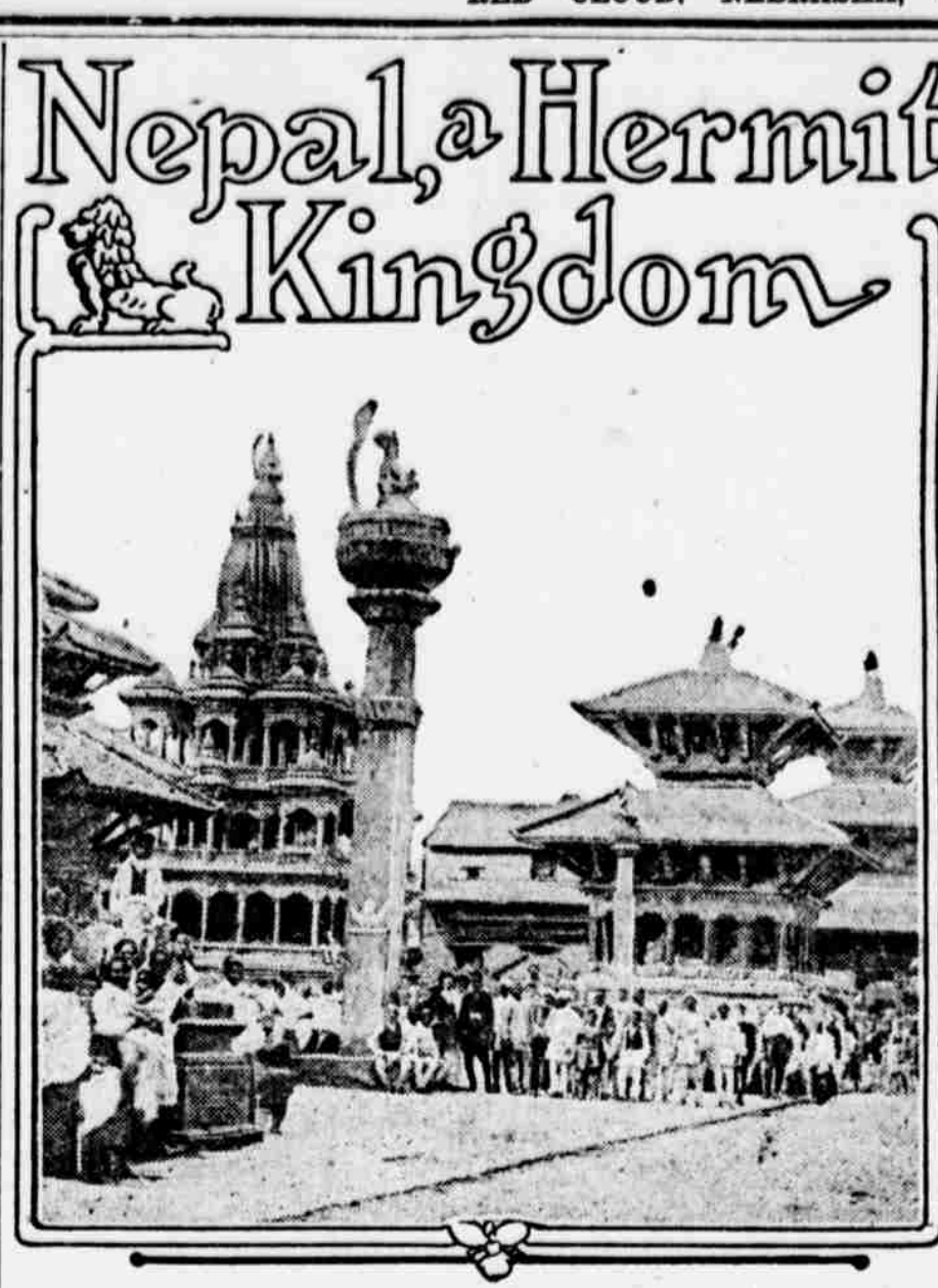
Street Scene in Patan, Nepal.

clety, Washington, D. C.) Nepal, in which is situated much of Mt. Everest, the world's highest pinnacle, which is now being attacked by an elaborately equipped British scientific expedition, is the true "her-