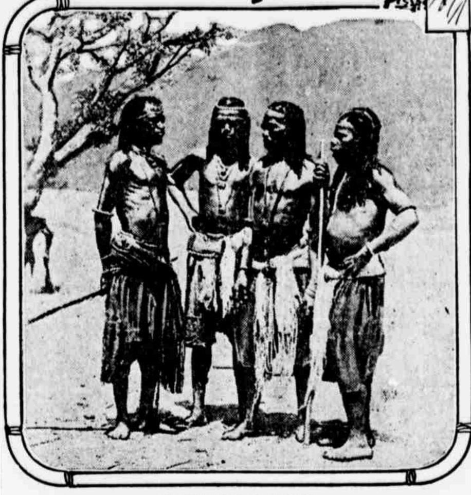
Mountaineers of Senegal.

Prepared by the National Geographic Society, Washington, D. C.