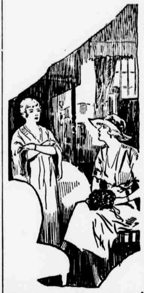
"Married! To Whom Are You Married?"

"Heavens! I'm tired!" she exclaimed. "These women in Hazelmead hang onto one like a lot of hungry cats. They all want money