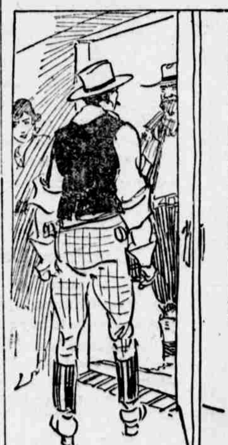
"What the H-I Is Up, Macklin?"

"No I ain't. The fellow joined my outfit up on the mesa yesterdaysorter big fellow with light hair, an' a smooth face. He put up quite a spiel and claimed his name was Churchill. I didn't mor'n half believe him, but not knowin' what was up, I let the cuss drift in along with us. I almed to see you as soon as we got in; but