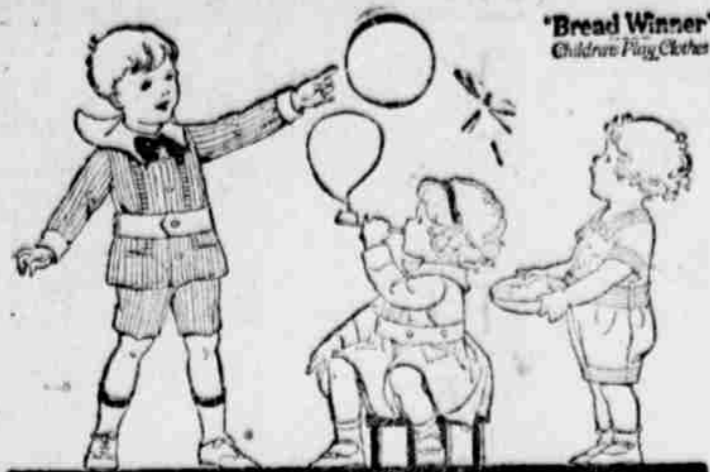
'Bread Winner' Children's Playclothes