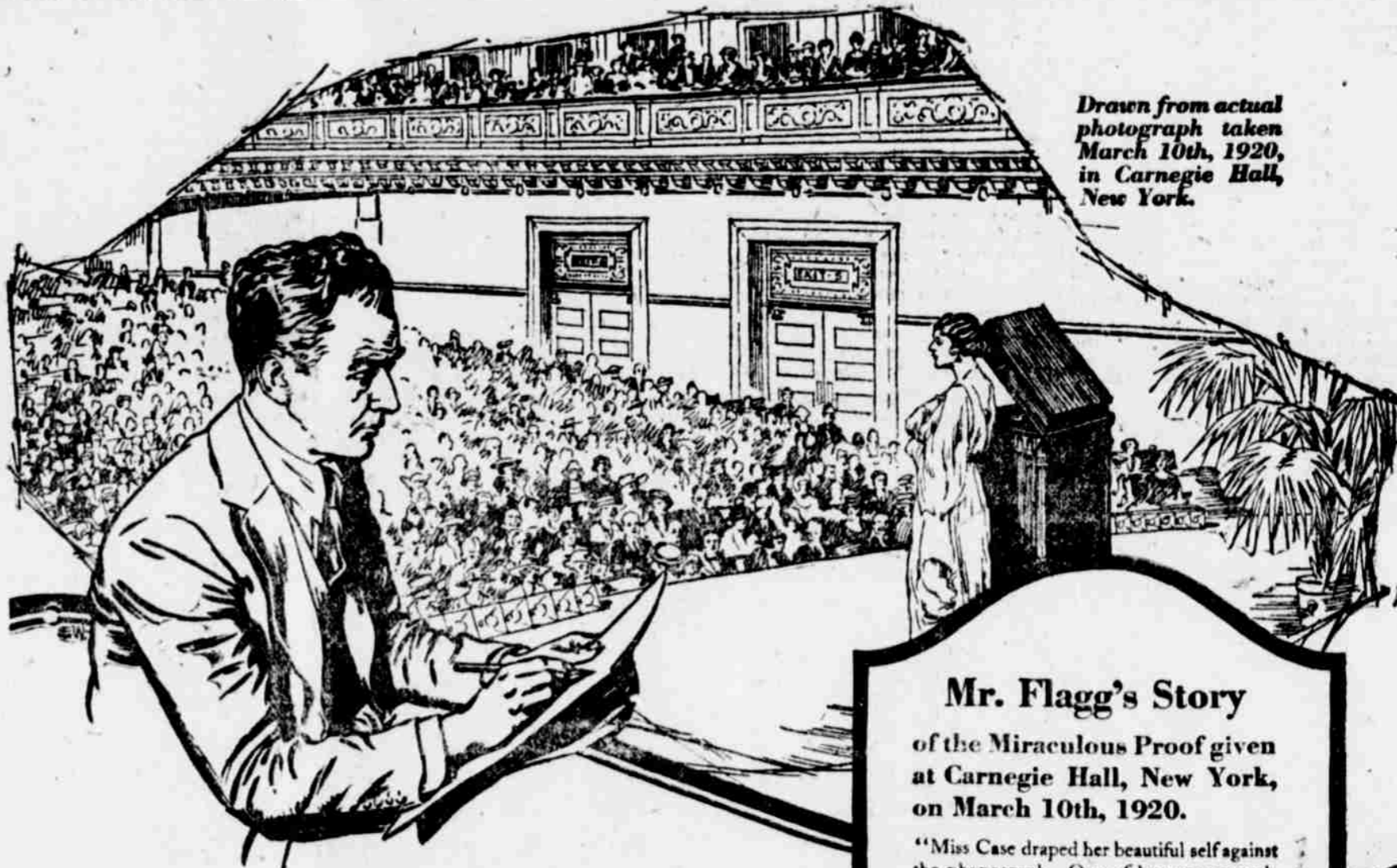
Drawn from actual photograph taken March 10th, 1920, in Carnegie Hall, New York.

Authorized Sales Agent Red Cloud, Nebraska