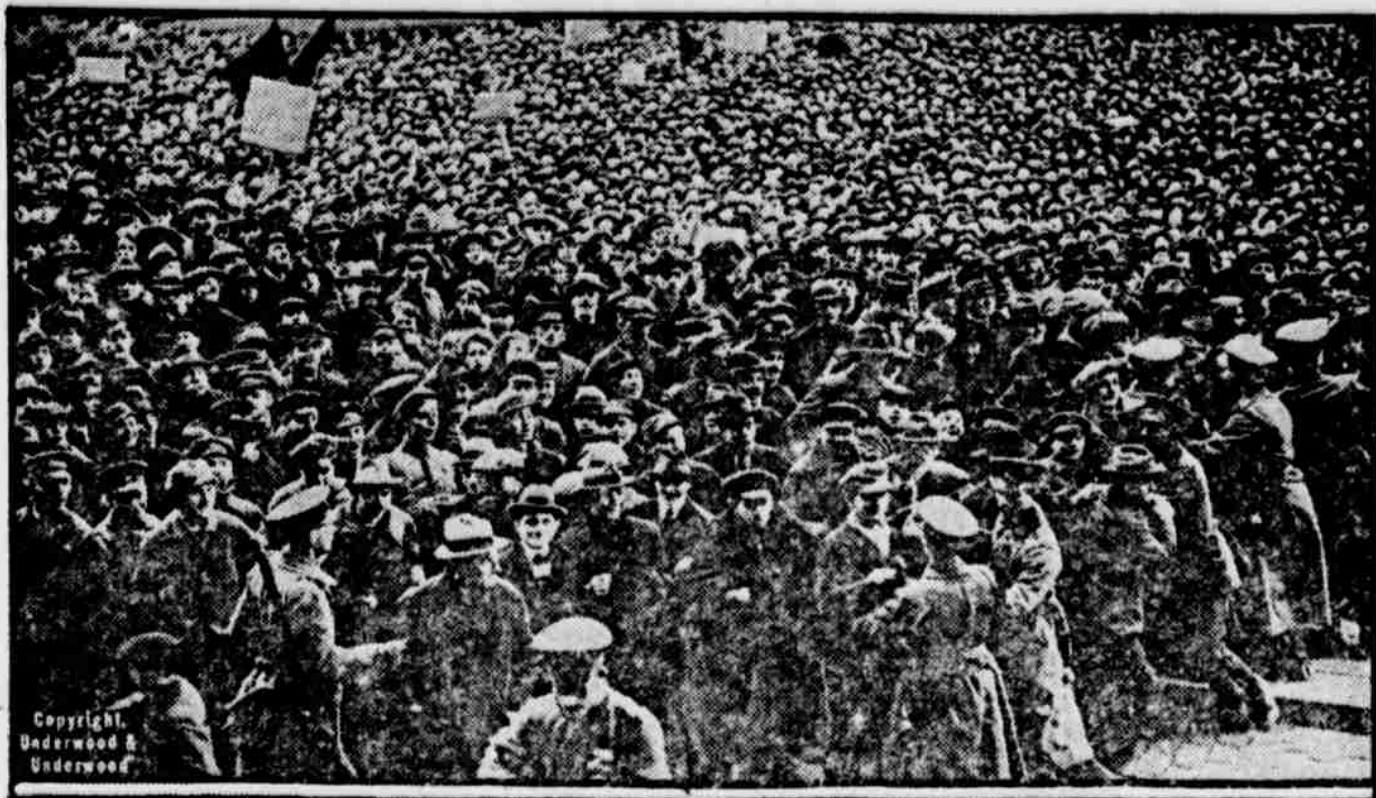
Photograph taken during the great demonstration in Berlin against the law governing workmen's councils. The mob is seen breaking through the lines of the surety police in front of the reichstag. Later the police and troops opened fire on the crowd, killing many persons.