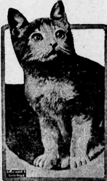
This is the mascot of the battleship Brooklyn. She has accompanied that vessel during its five years of service in Asiatic waters and is now with it at San Francisco.