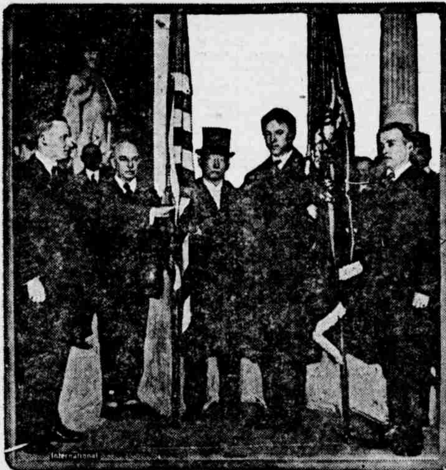
Ceremony at the state house, Boston, when the fourteenth Railroad engineers, A. E. F., presented to the state of Massachusetts the national and state colors carried by the unit while serving through the great war. Governor Coolidge is at the left, receiving the flags.