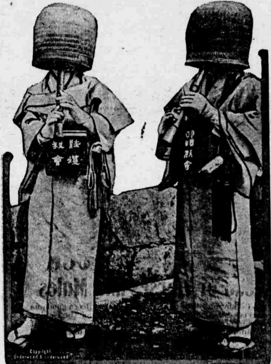
If a good-looking American woman musician were to hide her face from the public, we would put her down as crazy. But in Kioto, Japan, customs are widely different from ours. The two girls in this photograph serenade the public with their flutes, with their heads and faces covered by basket-like hats.