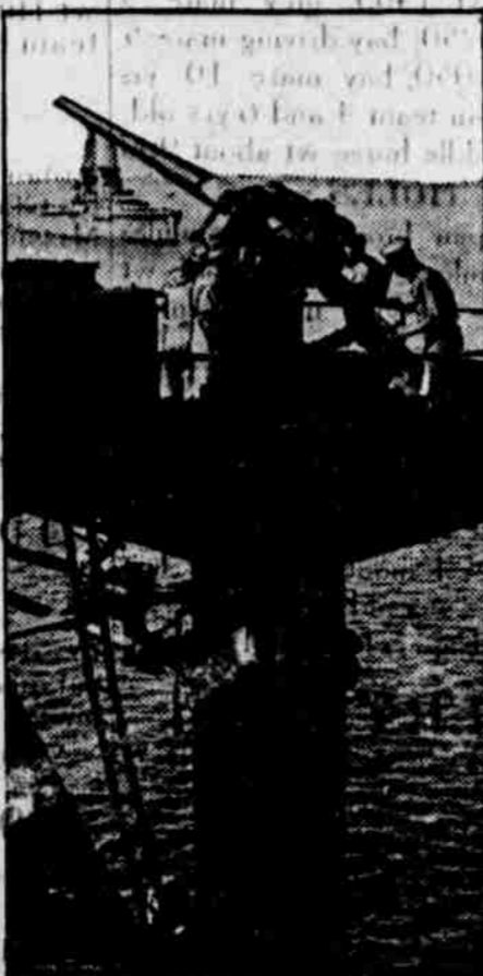
Antiaircraft gunners of the battleship Florida, now at Guantanamo, going over their "Archie" and gun deck in the periodical cleanup of the ship.