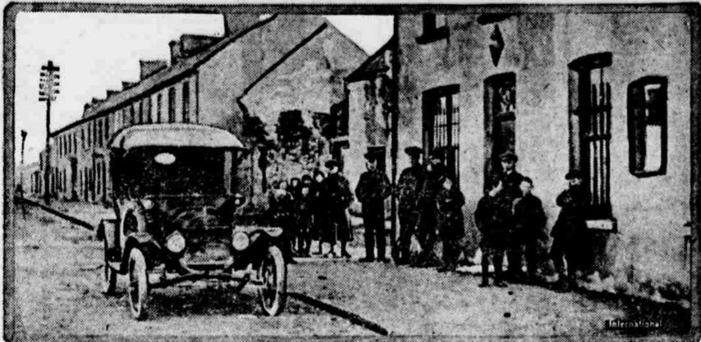
Barracks of the Irish constabulary are the objects of frequent attacks by the Sinn Feiners. The illustration shows the ruins of the police station at Carrigrohilly, Cork county, which was attacked by 300 armed men, and after a desperate resistance was blown up and captured.