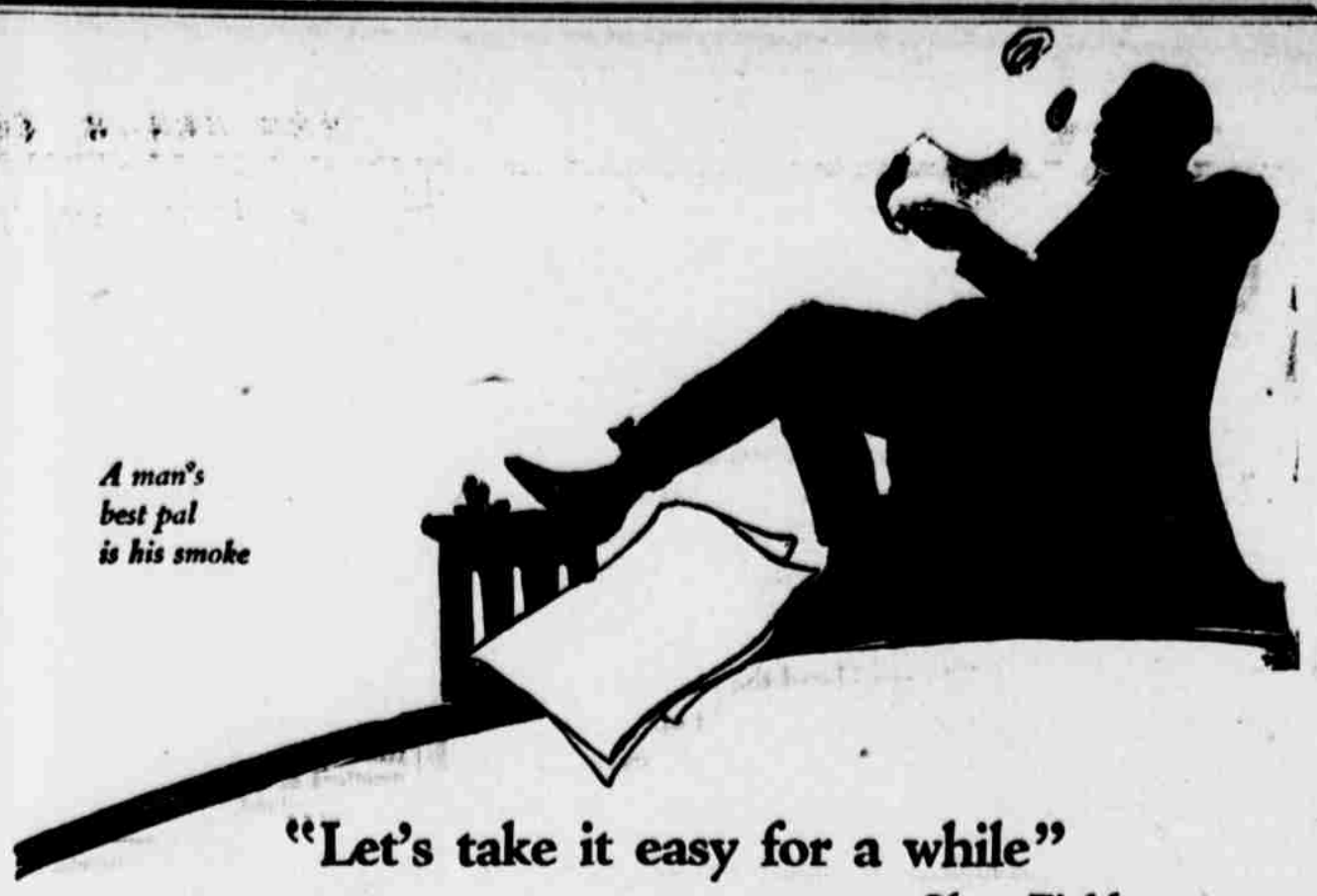
A man's best pal is his smoke