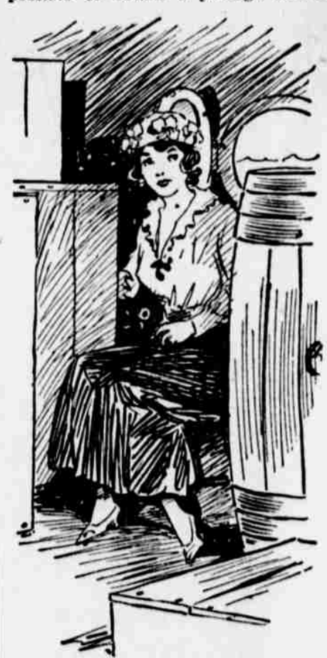
Hid in a Nook Until the Vessel Was Out of Sight of Land.

Becoming convinced that it was impossible to obtain a passage before