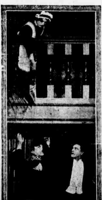
JOHN BARRYMORE "RAFFLES THE MATERIAL CRACKSMAN"

The most thrilling detective drama that ever blazed its way into every corner of the world.