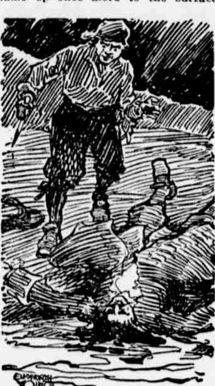
Made No Cry, No Struggle.

He was too strong, too immense of stature. Apparently unweakened by his wounds, the giant negro, thoroughly aroused, exerted his mighty muscles, and, despite my utmost effort at resistance, thrust me back against the stern rail, where the weight of his body pinned me helplessly. With a roar of rage he drove his huge fist into my face, but happily was too close to give much force to the blow. My own hands, gripping the neckband of his coarse shirt, twisted it tight about the great throat until, in desperation, panting for breath, the huge brute actually lifted me in his arms and hurled me backward headlong over the rail. I struck something as I fell, yet rebounding from this splashed into the deep water and went down so nearly unconscious as to make not even the slightest struggle. And yet 1 came up once more to the surface.