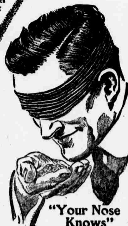
"Your Nose Knows"

Finest Burley Tobacco Mellow-aged till perfect + a dash of Chocolate