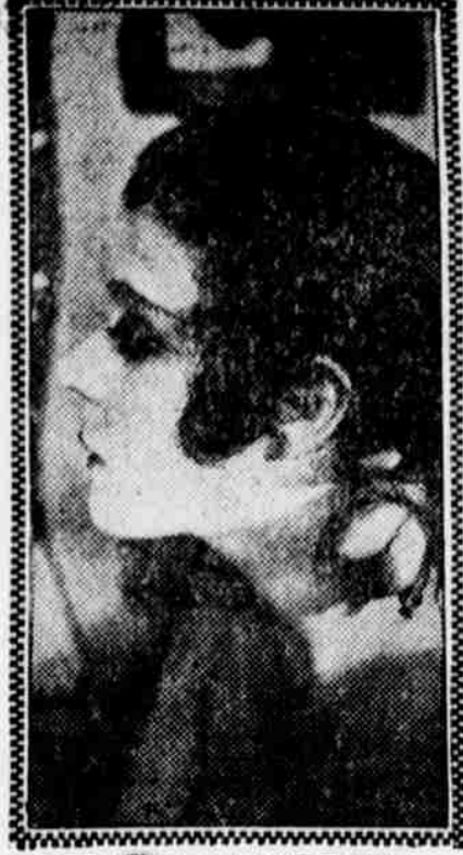
THEDA TARA AS CLEOPATRA

The League of Nations circulated through the land to the effect that it would be a fear al that time until 1880 it was an empire; thing for this nation to enter the since 1880 it has been a republic. League of Nations because in so do-