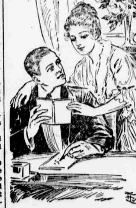
"Oh, Did I Do That?" She Asked, Looking Over His Shoulder.

Daphne, having no gifts for spinning, cooking, or laundry, tried the theater. Her old-fashioned lover pro-