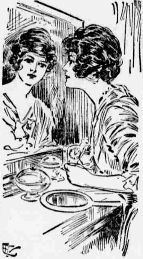
She Stared at Her Image in the Mirror.

When the car reached her building she was resolved to see Duane no more. She could not tell him so. After all, he had been everything that was courtesy and charity. It would hardly