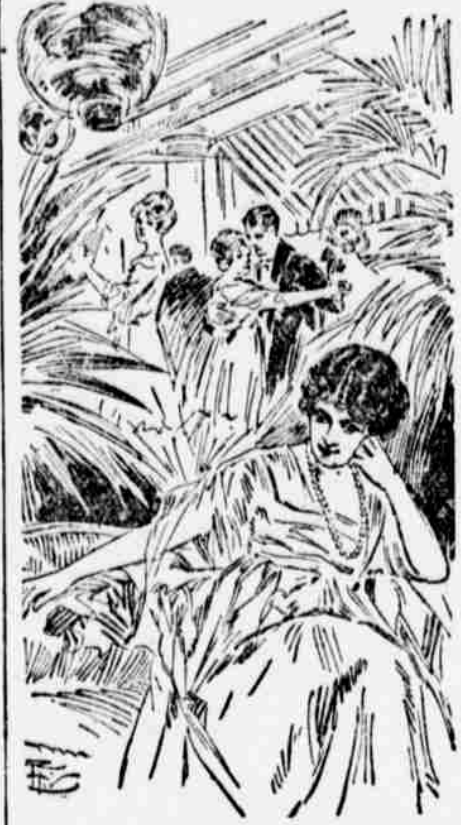
Lella Had Decided That It Was Better for Her Health to Stay at Newport Till the Cooler Weather Came and Her Summer Wardrobe Had Been Worn Out.

Bayard and Lella had more money to spend, and they made ambitious voyages. But Daphne and Clay must swelter with the other stay-at-home millions. Clay denied himself even the two weeks' vacation allotted to him. Bayard took his, however, and carried