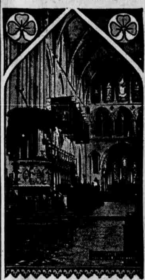
Interior of St. Patrick's.

In the year 433 he celebrated Easter by converting many thousands of the the services he went to Tara to try to convert the king. But the king would