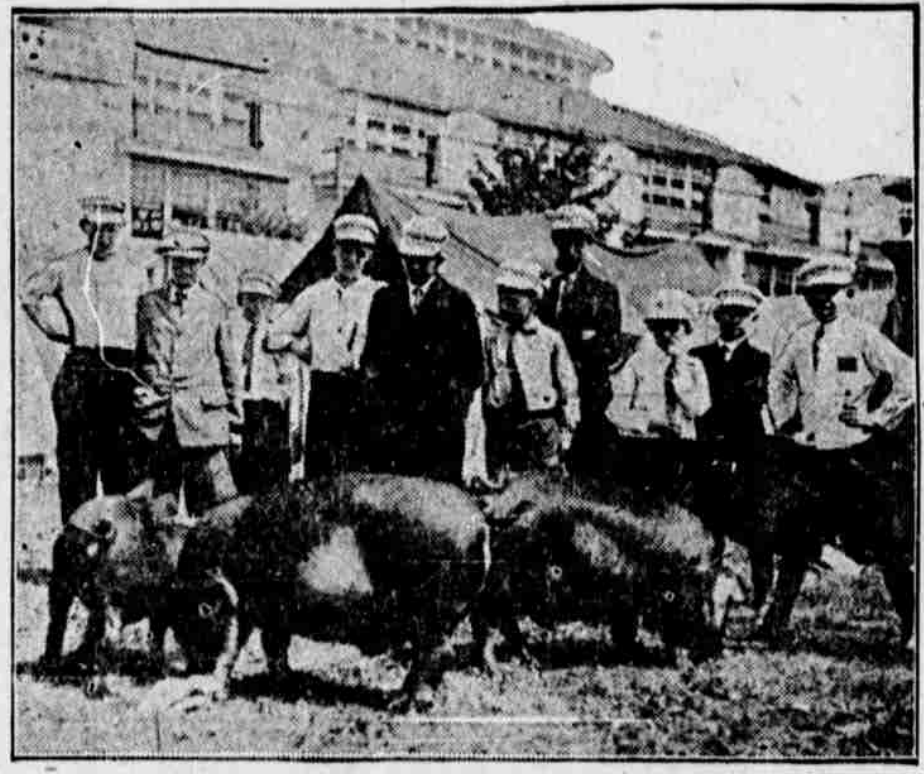
PIG CLUB MEMBERS EXHIBITING PRIZE HOGS.

The weeds of yesterday may become the cultivated crops of tomorrow. Not many decades ago, at least in the memory of some persons now living, the tomato was a weed of little value and picture shows further how to feed and generally believed to be poisonous. Not care for the pigs, how to protect them more than five years ago sweet clover,