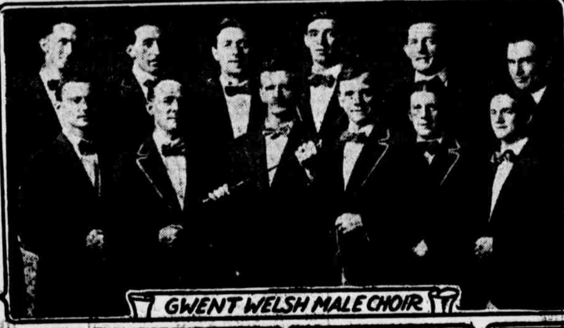
GWENT WELSH MALE CHOIR