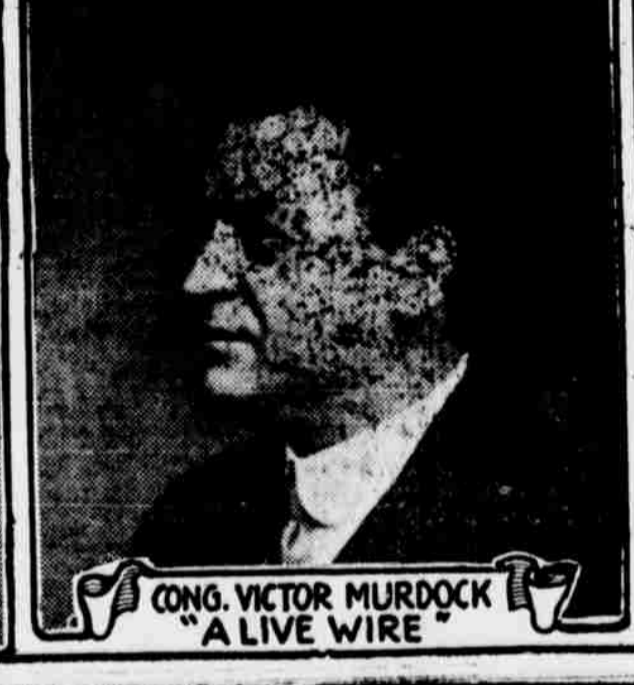
CONG. VICTOR MURDOCK "A LIVE WIRE"