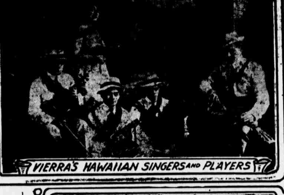
VIERRA'S HAWAIIAN SINGERS AND PLAYERS