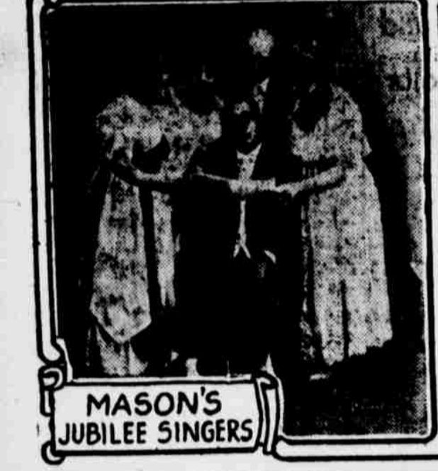
MASON'S JUBILEE SINGERS