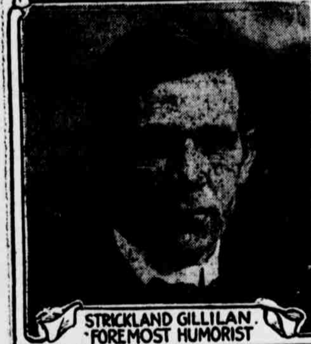
STRICKLAND GILLILAN. FOREMOST HUMORIST