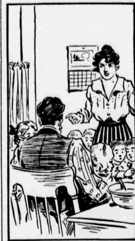
She Wanted Fights, and She Won Them All.