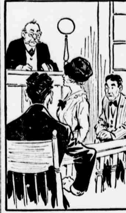
Told How She Had Lived a Double Life.

The young woman told, between sighs and sniffles, of how she had lived a double life on a single block, at the ends of which were the homes her